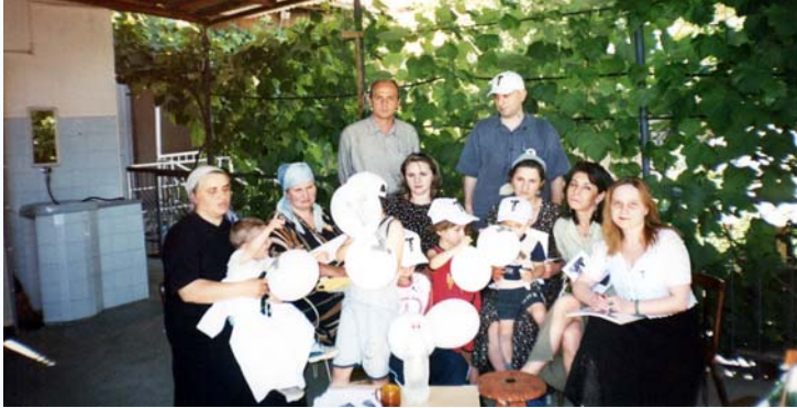
EMPATHY's meeting with refugees from Chechnya in Tbilisi, 26 June, 2003