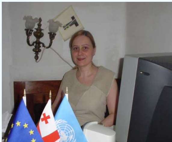
RCT/EMPATHY, Georgia; President, Medical Director WPA Section “Torture psychological consequences and persecution” member; PRI member