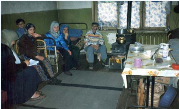
EMPATHY's visit in Pankisi

Torture Victims and Their Family members: Prisoners, Former Prisoners, State Repressive Victims, Refugees, Asylum Seekers or IDPs and Civilian Population living in Military conflict zone in Abkhazia – Victims of Torture and Inhuman Treatment. (All 450 persons – per year)