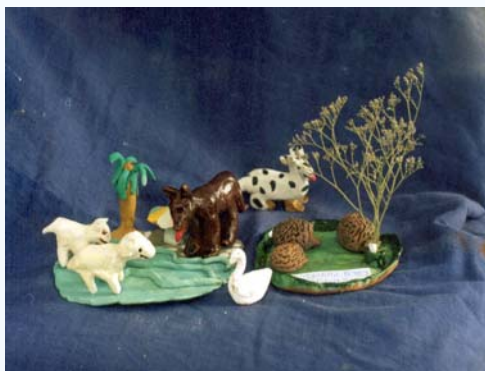
Women prisoners' Art-therapy Works Associated Partner: