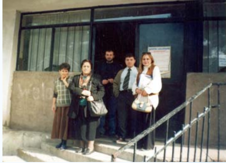
EMPATHY's visit in Gori in Youth House