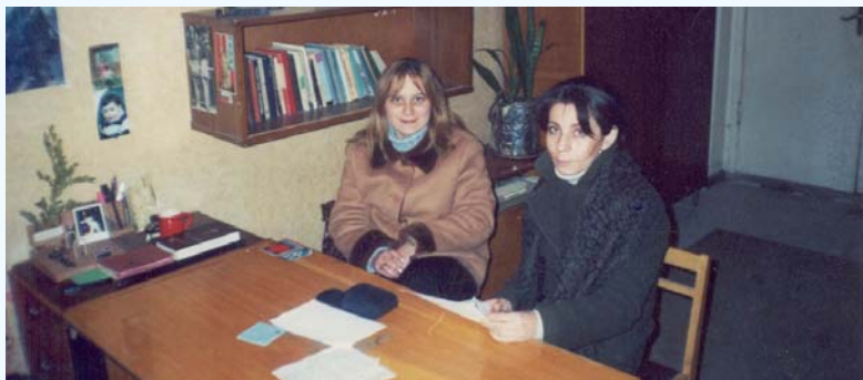
EMPATHY’s visit in Central Prison Hospital